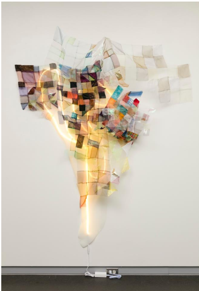
Holly Wong, Deconstructed Quilt 1 , 2022. Silk, cotton and organza with LED lighting, 60 x 60 x 18 inches.

In my wall-based installations “Deconstructed Quilt 1” and “Deconstructed Quilt 2,” I use a flat felled seam technique inspired by Korean bojagi with transparent fabrics such as silk, organza and netting, sewn with invisible thread. I combine these ephemeral materials with LED strip lighting and photo diffusion film so that the LED light connected to the wall has a blurred or diffuse effect. My larger scale “Body of Light” installation suspends from the ceiling using aircraft cable and involves similar materials and approach. What is different about “Body of Light” is the fact that the piece was installed in front of windows facing the San Francisco Bay. It was a site-responsive work for the Fort Mason Festival pavilion as part of Art Market San Francisco 2023. My gallery SLATE Contemporary had suggested that I make a work that integrated the incredible light of the Bay Area as seen through the layers of the fabric itself. It was exciting to see visitors walk through the work and interact with it, at times relating to it as a kind of haven