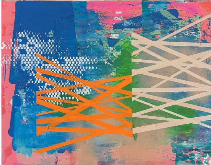
Passages, 2024, acrylic and spray paint on canvas, 11 x 14 inches

Mark “All The Stars In The Sea” as a “do not miss” exhibit for art enthusiasts and environmental advocates. With over 25 solo exhibitions to her credit and a strong presence in public collections across the country, Rutstein’s work continues to captivate audiences on a global scale.