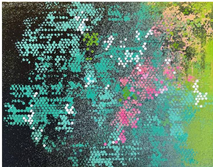
Feeling all the Feels, 2024, acrylic and spray paint on canvas, 11 x 14 inches