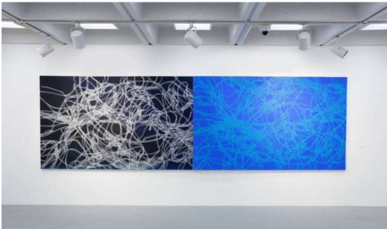
"Progenitor Series", 2018-20, 66 x 216" Acrylic on Canvas

DISCOVER WEAR USE LOOK LISTEN CONSUME EXPLORE CALENDAR CONTACT