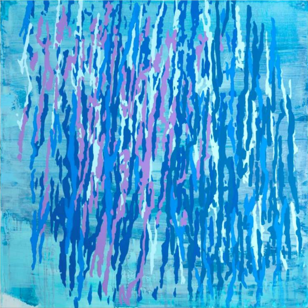
"Brine Forest", 2025, 48 x 48" Acrylic on Canvas