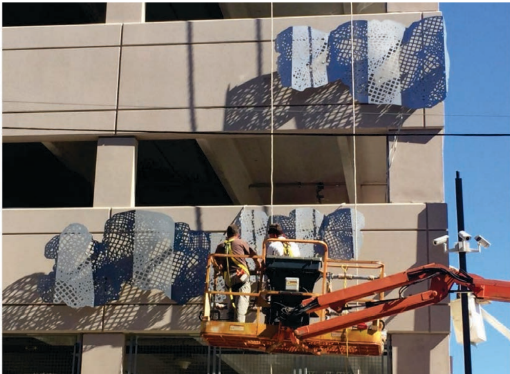
Installing Rebecca Rutstein's "Sky Terrain" on the Temple campus.

The public art process is Saturn to a studio artist's Mars — worlds apart and nothing alike. There were frustrations working with a big team and juggling multiple deadlines of engineers, fabricators and lighting specialists. At times Rutstein's studio resembled a factory, with pieces of "Sky Terrain" lined up against the walls or sprawled on the floor as team members positioned lighting elements and others affixed specially-made brackets that would hold the pieces in place to withstand harsh outdoor elements like wind, rain, snow and ice.