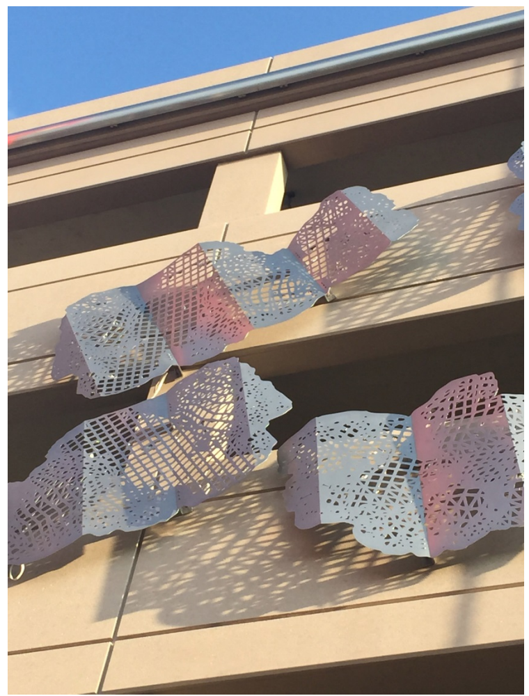
Rebecca Rutstein, "Sky Terrain" – (detail – West side façade 11<sup>th</sup> Street) Image Courtesy Rebecca Rutstein& Bridgette Mayer Gallery, Philadelphia, PA

Rutstein presented a concept for eighteen floating cloud sculptures constructed of bent steel that started at the base of the garage and float up to the top of the five story building, breaking the architecture at the top of the structure. Each 5 \times 10' cloud was designed to be wired and back-lit to allow for the possibility of various lighting compositions. The committee was most excited about the variety of the lighting concepts, which includes a "starry night" feature in which the clouds twinkle with an illuminated node star effect.