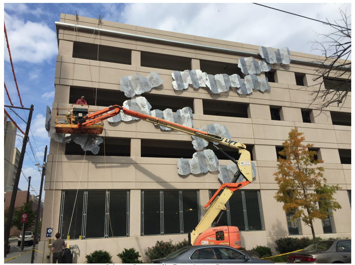
Rebecca Rutstein, "Sky Terrain" – Installation view

Rebecca Rutstein not only wanted to make an impact on the immediate lighting needs of the corner at 11<sup>th</sup> and Montgomery, but also hoped to give the students and others in the community who utilize this highly traveled corridor, an opportunity to pause and reflect. The addition of cloud-like forms floating effortlessly and changing colors during the day and then transform in the evening through animated lighting that mimics the sky and simulates twinkling stars, is an opportunity for the public to enjoy these nature-inspired phenomena in an urban environment.