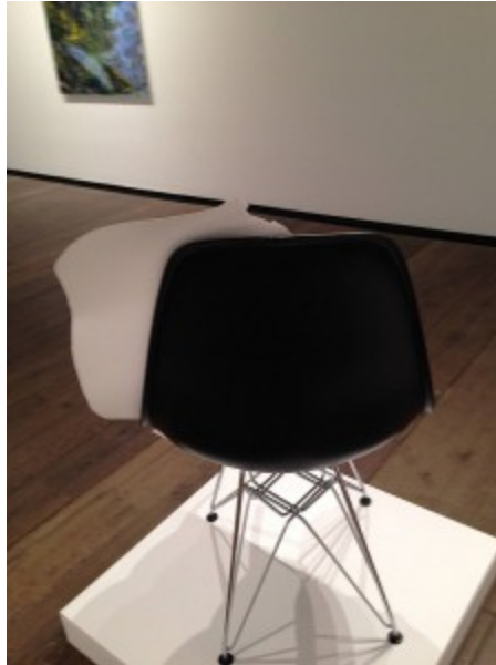
Eileen Neff, Seated, Archival Pigment on Latex Impregnated Paper, Cutout on chair