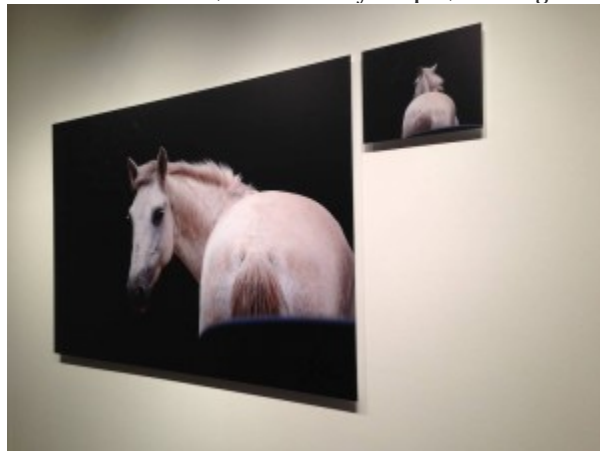
Eileen Neff, Horse by Car, 1 and 2, Archival Pigment on Dibond