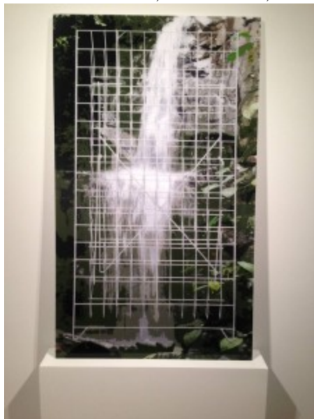
Eileen Neff, The Waterfall , C-print