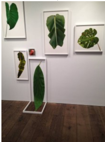
Eileen Neff, Leaf Wall Installation, Archival Inkjet Prints