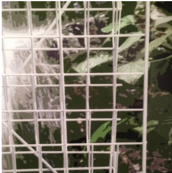
Eileen Neff, The Waterfall , detail