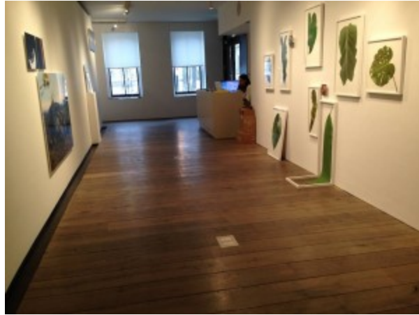
Eileen Neff, Installation view