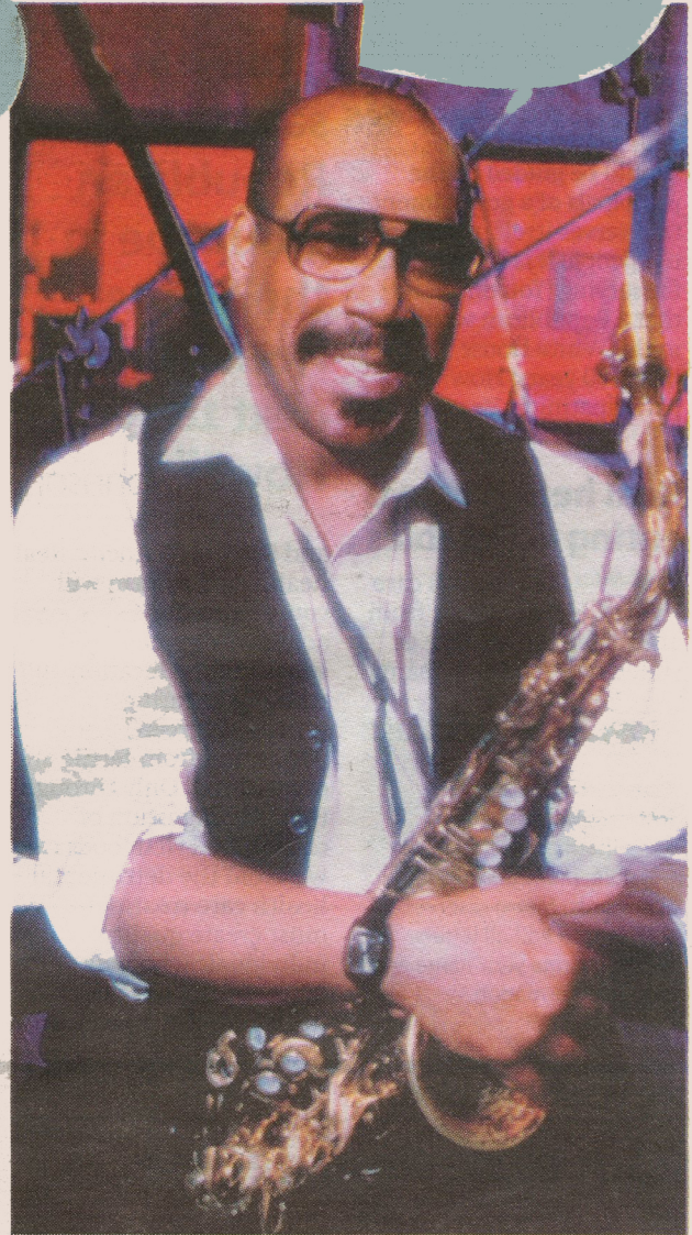
Sonny Fortune plays Chris' tomorrow.