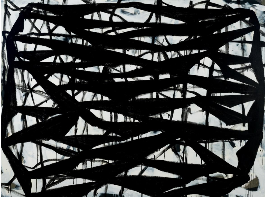
Black Drawing 3, 2024, acrylic on canvas, 63" x 84"