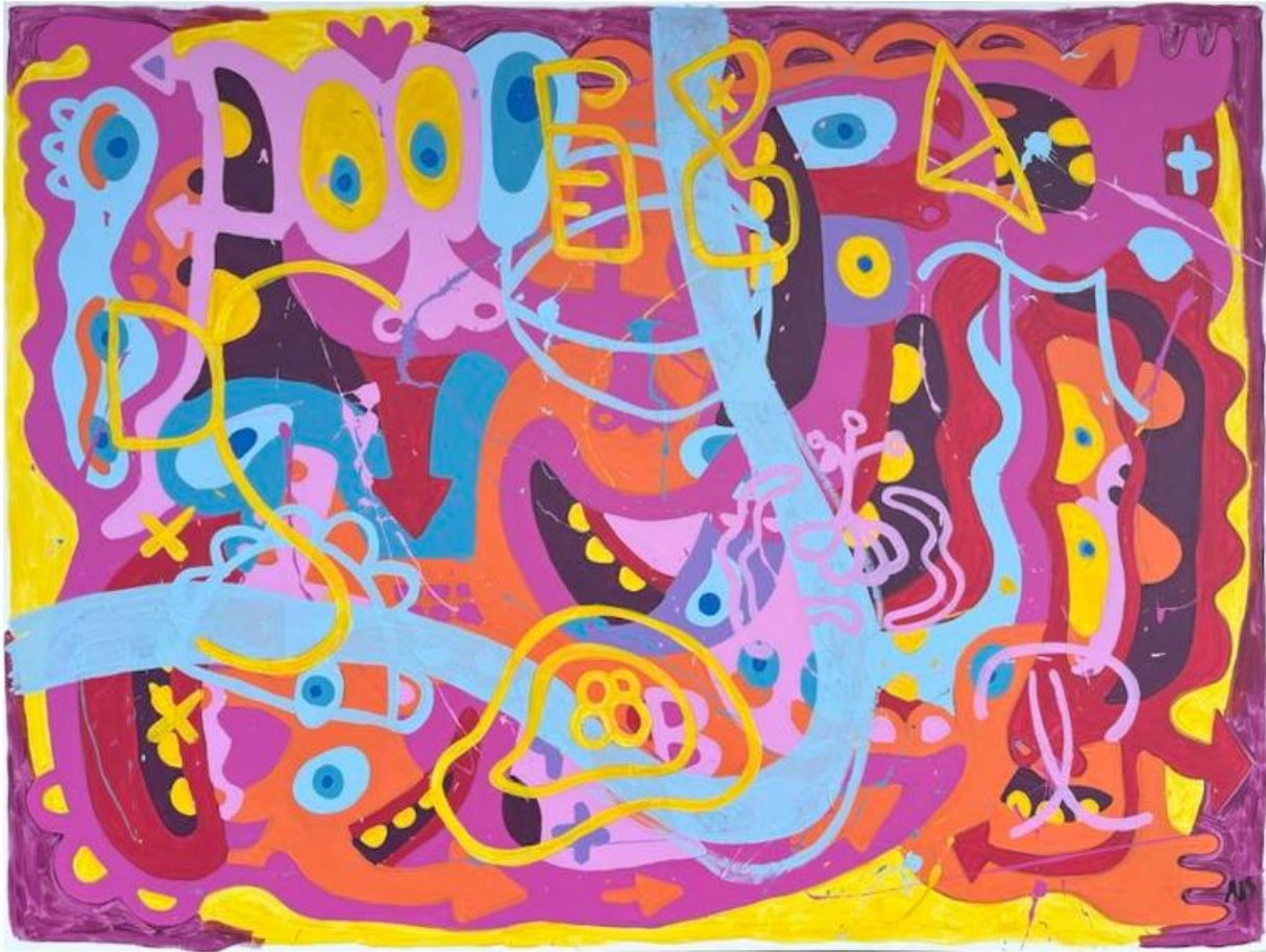
"Most Uncomfortable Coffee Shop Chair Ever" " 2024, acrylic on canvas, 62.99 x 47.24 inches

Raised on the punchy aesthetics of 1960s Pop and the gestural bravado of Abstract Expressionism, Nigel Sense gathers fragments of travel—street-market signage, overheard slang, a glimpse of neon across humid dusk—and lets them collide in paint. Drips run, lines misbehave, and typeface snippets fight for space, but the eye never feels crowded; instead, there is a lyrical rhythm to the chaos, a reminder that discovery is made in motion. Sense calls his roaming research trips “going fishing,” and you can trace every cast on the canvas: a hot-pink swipe echoes temple lanterns, while a chalky turquoise block seems to bottle the monsoon sky just before the downpour.