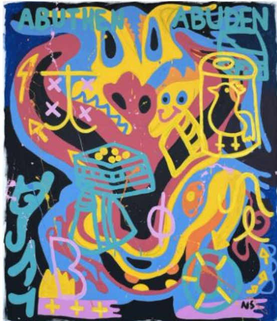
"Casio Keyboard Warrior" 2024, acrylic on canvas, 47.24 x 55.12 inches (right)