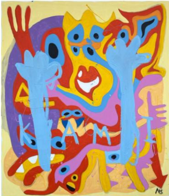
"Sunset With iPhone" 2024, acrylic on canvas, 47.24 x 55.12 inches (left)