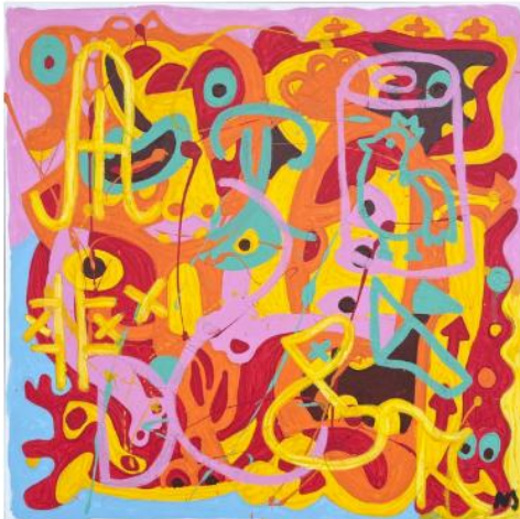
“Beers Always Cost More On The Beach” 2024, acrylic on canvas, 21.65 x 21.65 inches (left)

Stepping into Bridgette Mayer Gallery this spring is like uncorking a bottle of Malaysia's tart-sweet drink for which Nigel Sense names his first Philadelphia solo exhibition, “Asam Boi”. Eighteen new canvases line the white-brick walls, each a fizz of citrus-bright color and swaggering brushwork that pays homage to the artist's recent residency in Penang.