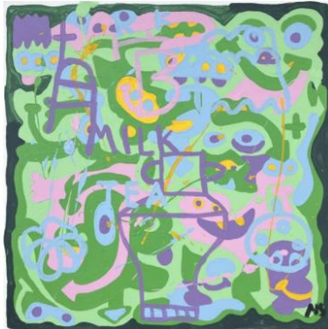
“Ice Milk Tea Time” 2024, acrylic on canvas, 21.65 x 21.65 inches (right)

709 Walnut Street 1st Floor Philadelphia PA 19106 tel 215 413 8893 fax 215 413 2283 email bmayer@bridgettemayergallery.com www.bridgettemayergallery.com