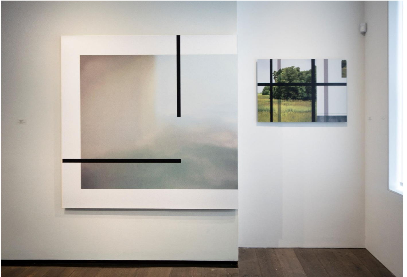
Installation view of Placeholder and Cloud Time .

The Bridgette Mayer Gallery, located on the first floor of 709 Walnut Street, is open to the public. Gallery hours are Tuesday – Saturday, 10:00am – 5:00pm.