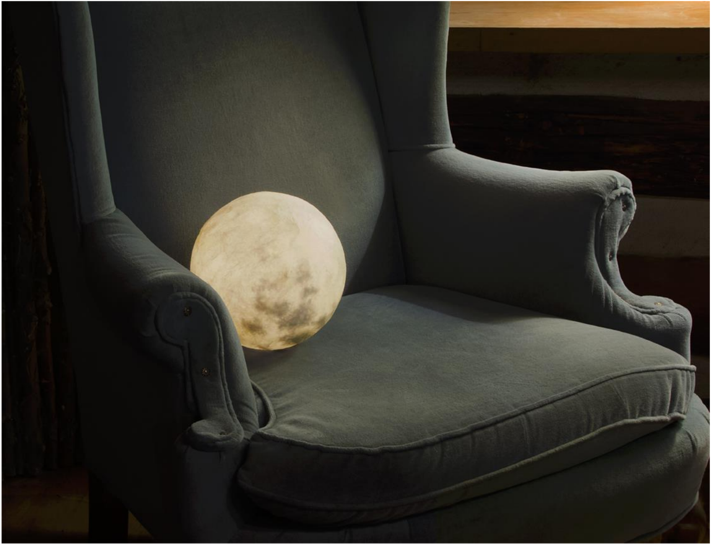
Moon in a Chair