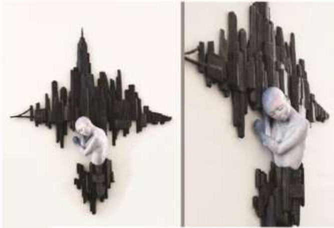
Vorvira Fern, Guide Me Home , 2023, Resin, Acrylic Paint, 14 x 12 x 2 inches