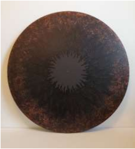
Maureen Drdak, Atman 3, Abraded acrylic, 23.5K gold, archival wood panel, 30 x 30 x 1 inches

In the process of selecting works for the exhibition, Mayer filtered through 120 submissions, each entry reflecting the dedication and skill nurtured through PAFA's esteemed programs. "This exhibition was a joy to curate," Mayer expressed, emphasizing the richness found within both large and small pieces, and the stunning variety of sculptural forms on display.