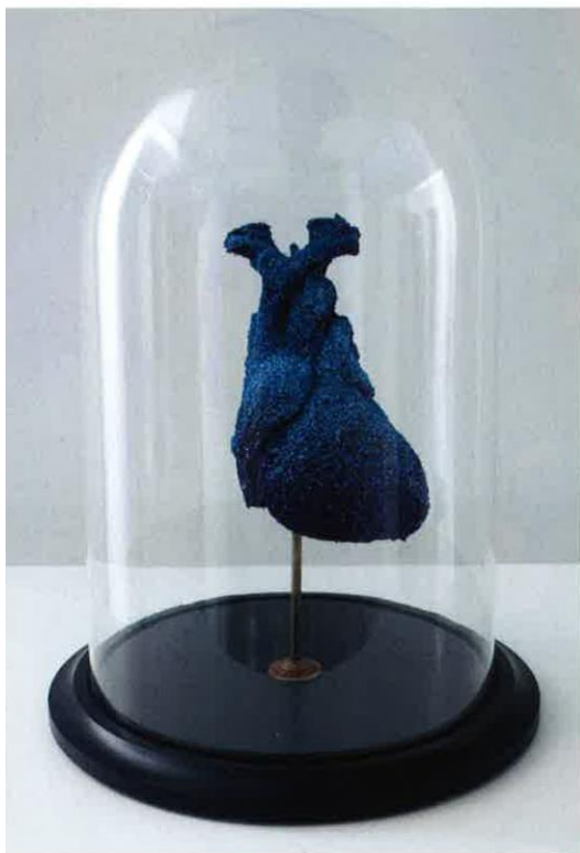
Pullman , 2010. Heart, glitter, glass, and wood, 17 x 8.5 x 8.5 in.