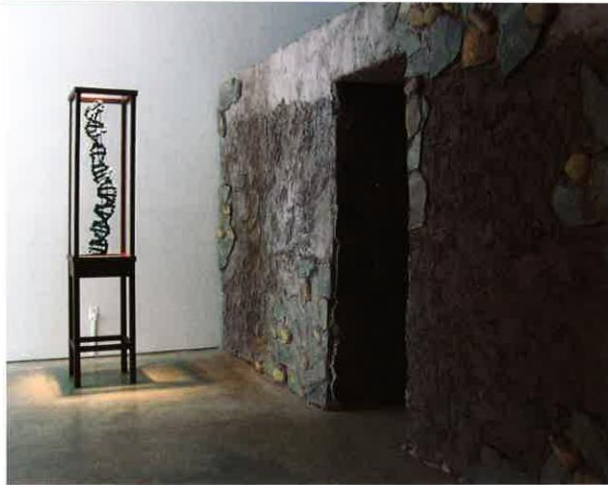
Installation view from In the Returnal , Solomon Projects, Atlanta, with (left) Stride , 2007, mixed media, velvet, glitter, steel, and wood vitrine, 87 x 19 x 19 in.