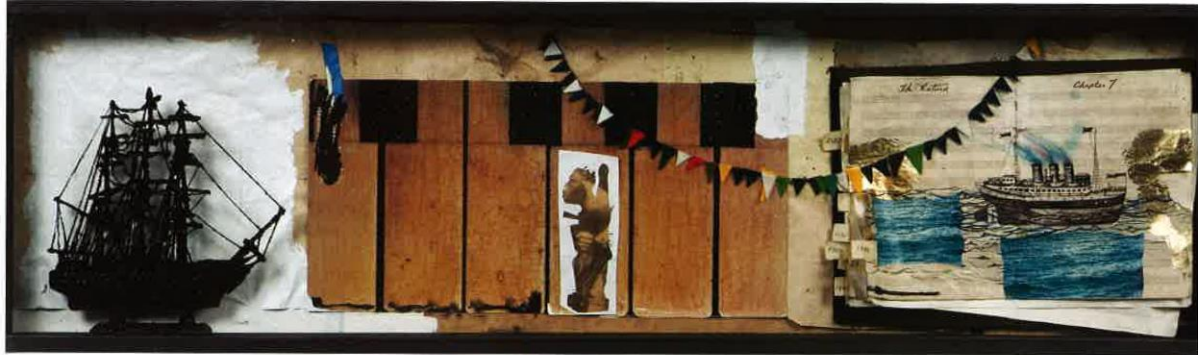
Above: Chapter 7 , 2007. Paper, acrylic, glitter, model ship, and gold leaf. 18 x 36 x 5 in. Below: Untitled , 2010. Mixed media, 95 x 70 in.

with something that treats a single time and place, but your works often bring together three different narratives: Africa, the African American experience, and your personal history. How do you weave these stories together?